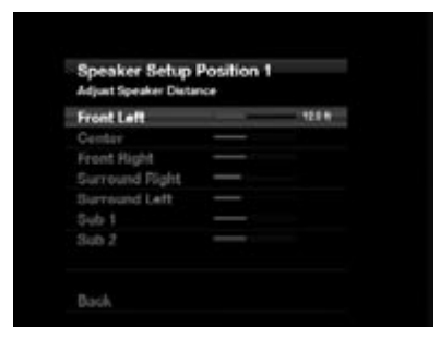
Figure 31 – Adjust Speaker Distance Menu

On the Speaker Setup Position menu, move the cursor to the Distance line and press the OK Button to display the Adjust Speaker Distance menu. See Figure 31.